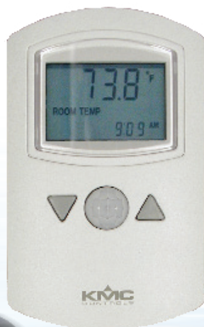
KMD-12x1 NetSensor with Motion Sensor

In building automation systems, sensors monitor air (temperature, humidity, CO 2 levels, CO levels, smoke, flow rate or pressure), water (temperature or pressure), or even motion/occupancy of people.