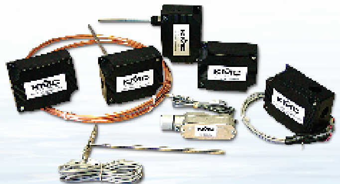
STE-1400 Series Temperature Sensors

Depending on the climate, however, temperature alone doesn't tell the whole story about human comfort. A (dry bulb) sensor temperature of 72° would feel very different to us at 10% relative humidity than it would at 90% relative humidity. Too much or too little humidity can be uncomfortable for people or even damaging to materials. KMC's THE-1xxx series humidity sensors can measure humidity in rooms or ducts. NetSensors and FlexStats with the optional humidity sensor measure and display room temperature as well as humidity.