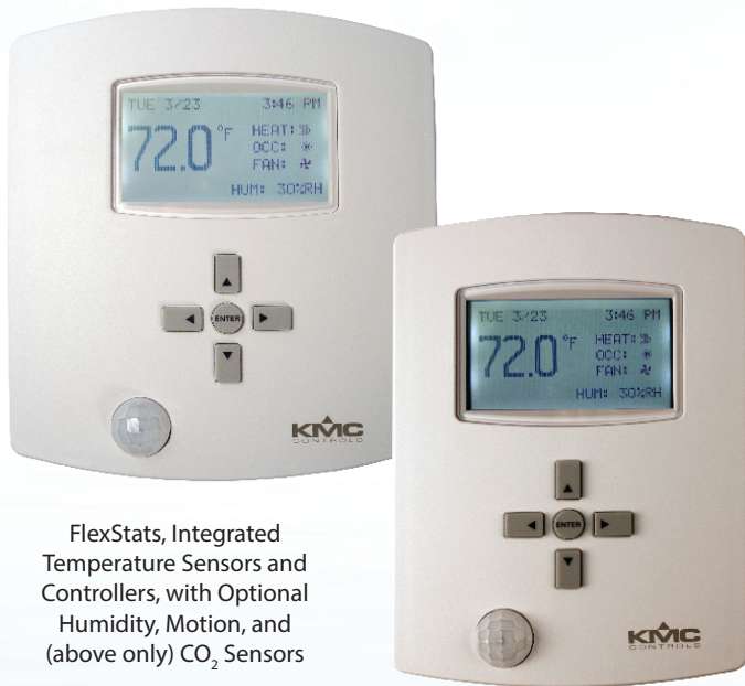
FlexStats, Integrated Temperature Sensors and Controllers, with Optional Humidity, Motion, and (above only) CO 2 Sensors

A complementary and far more sophisticated approach senses the gas that people breathe out. By measuring the levels of CO 2 , Demand Control Ventilation (DCV) estimates the amount of occupancy and required (healthy) levels of ventilation and adjusts the ventilation accordingly. SAE-1000 series CO 2 detectors provide CO 2 measurements in rooms or ducts to external controllers. FlexStats with the CO 2 sensor option integrate demand control ventilation with temperature and optional humidity control.