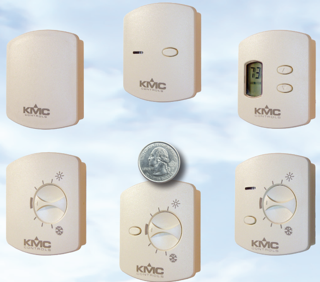
STE-6000 Series Room Temperature Sensors